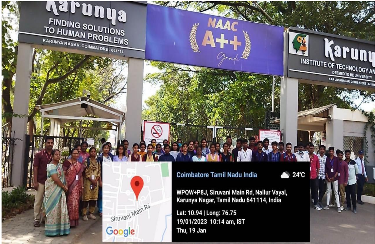
Institutional Visit at Karunya Institute of Technology and Science, Coimbatore