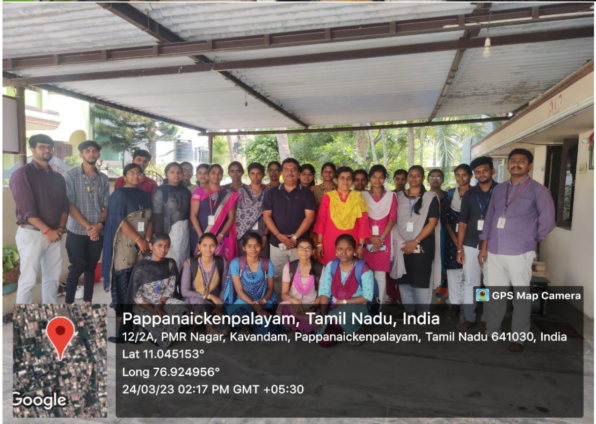
Demonstrating the Voltage Frequency Drive in New Amp and Ohm Company